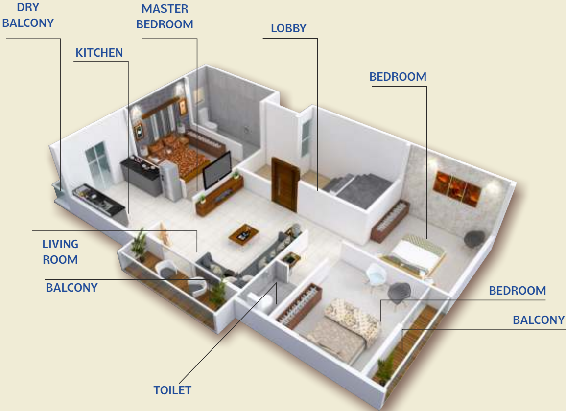
Typical floor Cut View Plan