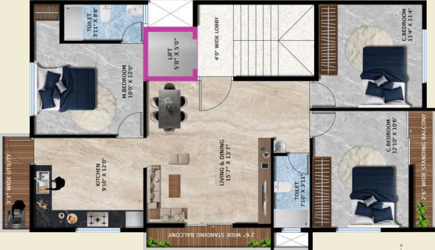
1st to 4th Floor Plan